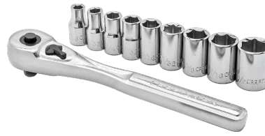
1/8" wrench or socket and 3/4" wrench or socket