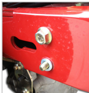
(3) Add lock washer