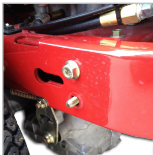
(2) Remove Nut