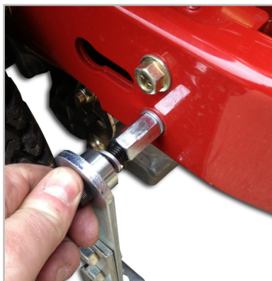
(5) Thread pivot bolt