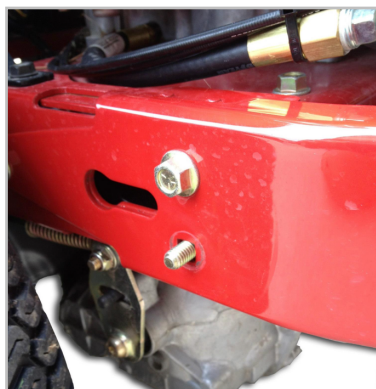
(2) Install bolt