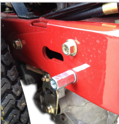
(4) Tighten coupler nut