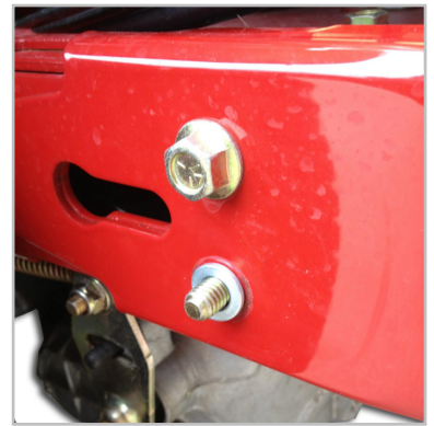
(3) Add lock washer