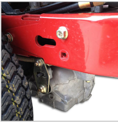
(1) Acquire Hole