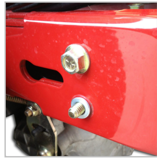
(3) Add lock washer