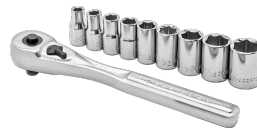
Crescent Wrench or 9/16" and 3/4" wrench or socket