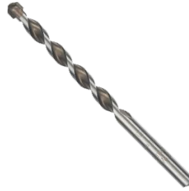
3/8" Drill Bit (*Depends on mower.)