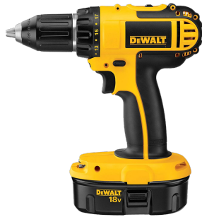
Drill (*Depends on mower.)