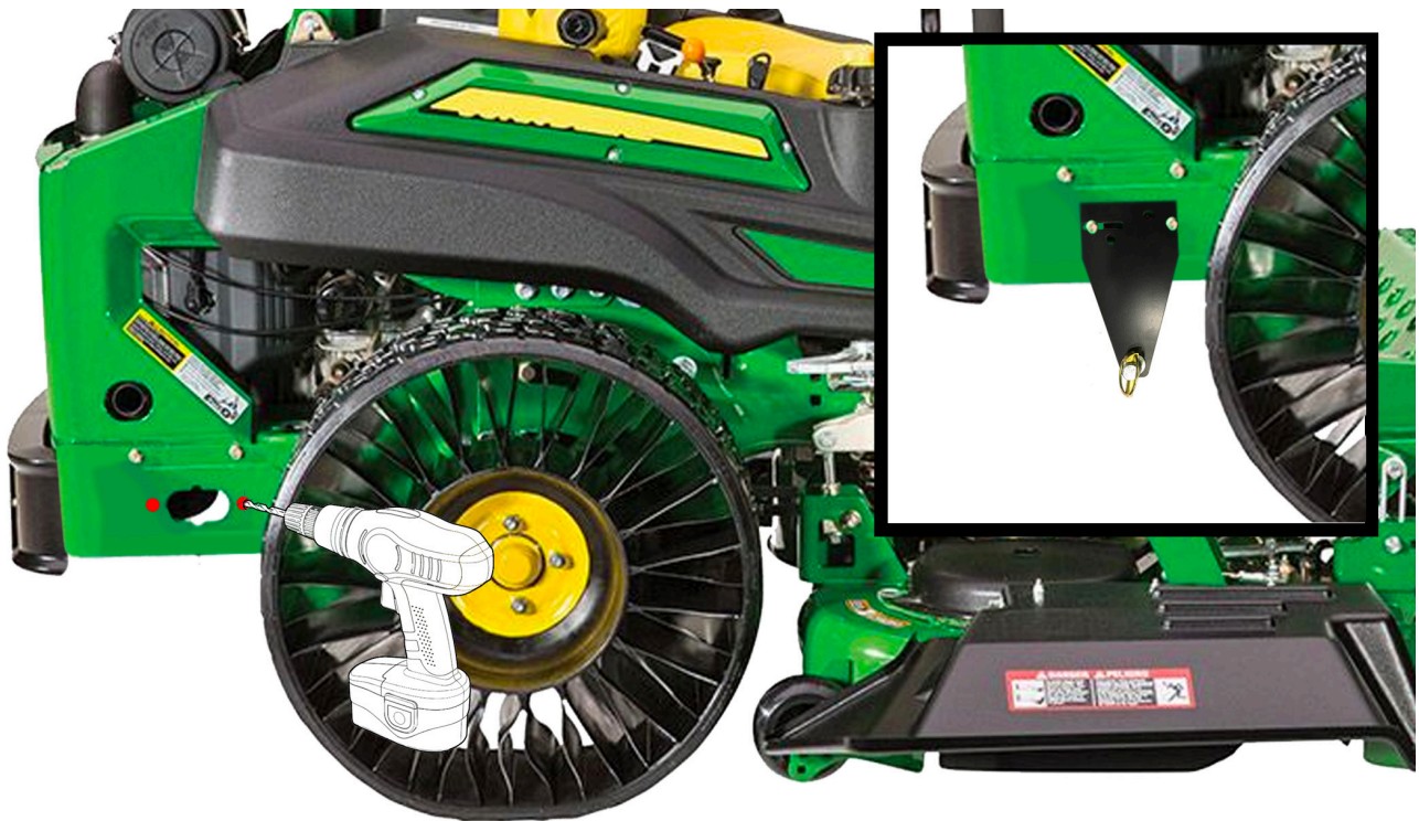
John Deere Z900 Series

Attach the Quick Release plates to the side framing at the back of the machine. (2) 3/8" holes will need to be drilled into the machine in order to properly mount the plates. The two marked red dots below will be your mounting hole locations.