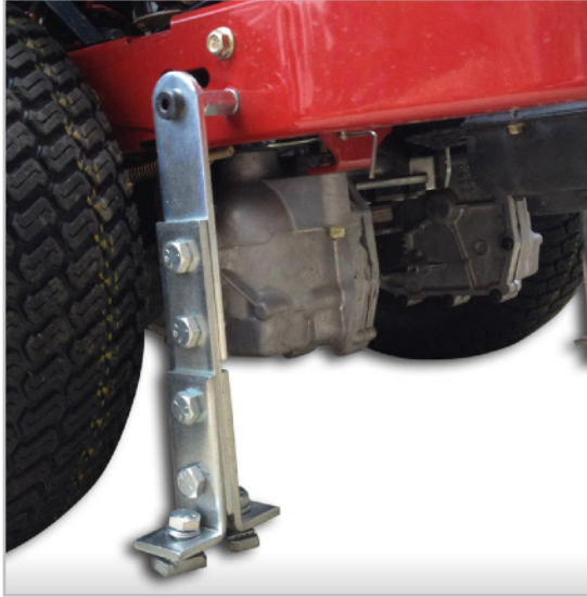
Photo demonstrates how the CheckMate™ mounting arm should freely swivel once attached to the coupler nut.